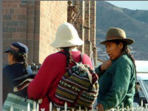
African and Latin American Cultures