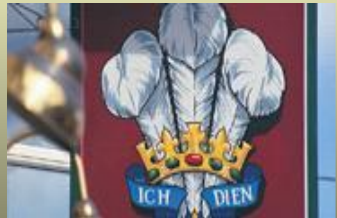
The Prince of Wales Feathers