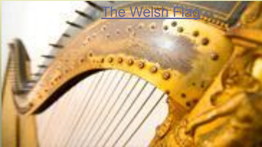
The Welsh Flag