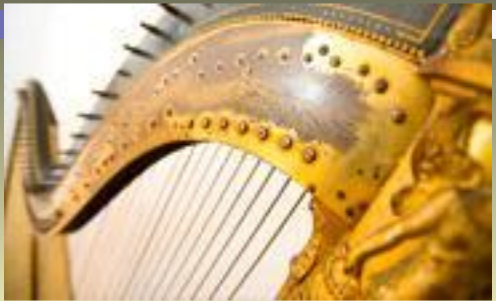
■ The Harp

The harp is regarded as the national instrument of Wales. By the end of the 18th century, the triple harp - so called because it had three rows of strings - was widely known as the Welsh harp on account of its popularity in Wales. The harp has been used through the ages as an accompaniment to folk-singing and dancing and as a solo instrument. HRH Prince Charles appoints a Welsh Royal Harpist on a scholarship programme annually. Past Royal harpists include Catrin Finch.