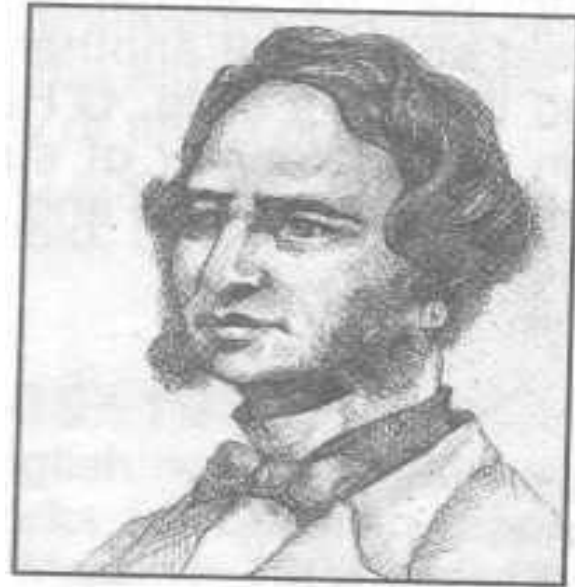
Henry Wadsworth Longfellow

Henry Wadsworth Longfellow was one of the most widely read American poets of the 19th century. From 1835 to 1854 he was Smith Professor of Modern Languages at Harvard. In 1884, 2 years after his death, he became the first American to be honoured with a bust in the Poets' Corner of Westminster Abbey, London. He is best remembered for poems such as "The Song of Hiawatha" and "Paul Revere's Ride."