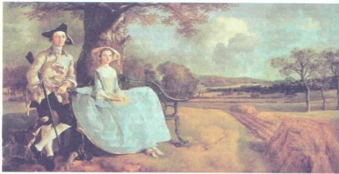
Thomas Gainsborough. "Robert Andrews and His Wife"

Thomas Gainsborough (1727-1788). A very lyrical painter who successfully connected man and nature. A very strong psychologist, he painted mostly women on the background of a scenery.