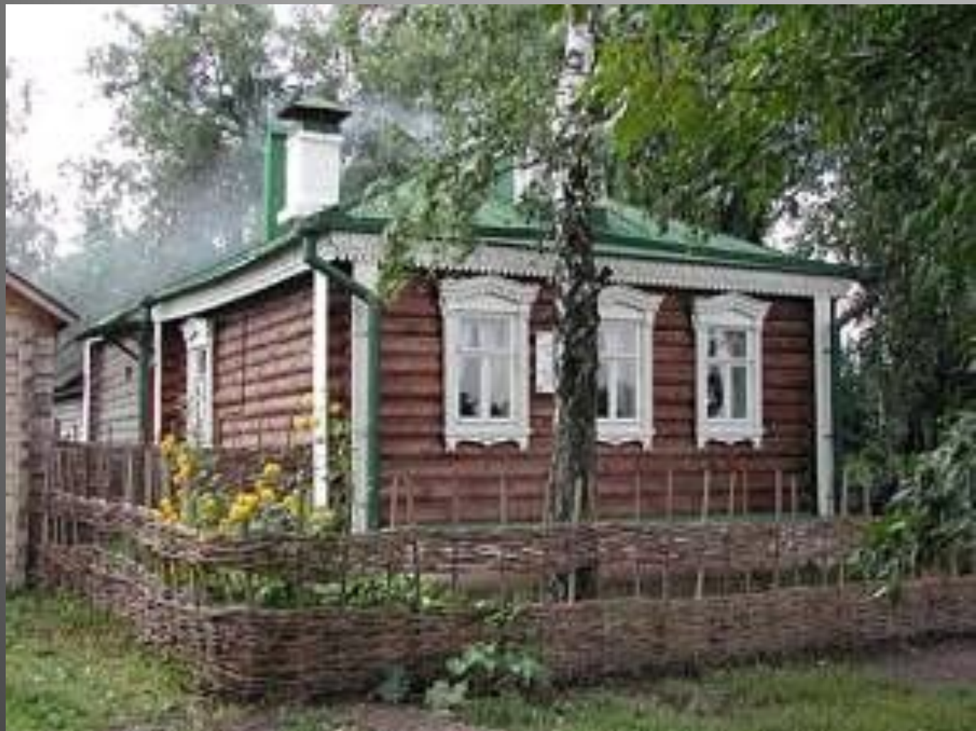
The house-Museum of Sergei Alexandrovich Yesenin