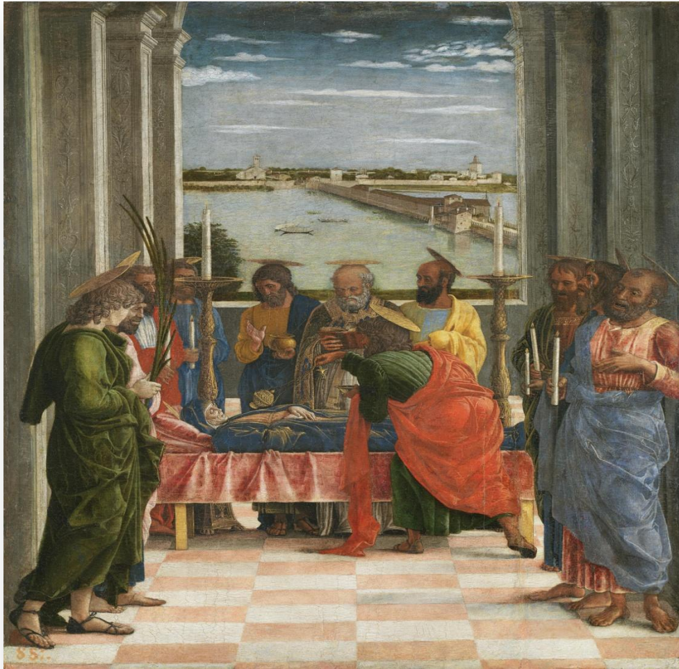
El Tránsito de la Virgen

One of the top museums in Spain, The Prado Museum in Madrid features some of the best collections of European art, from the 12th century to the early 19th century. The best known works on display at the museum are the Majas of Goya (La Maja Vestida and La Maja Desnuda) and Las Meninas by Velázquez.