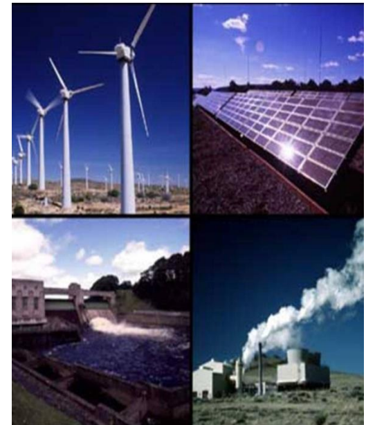
Clean Renewable Energy