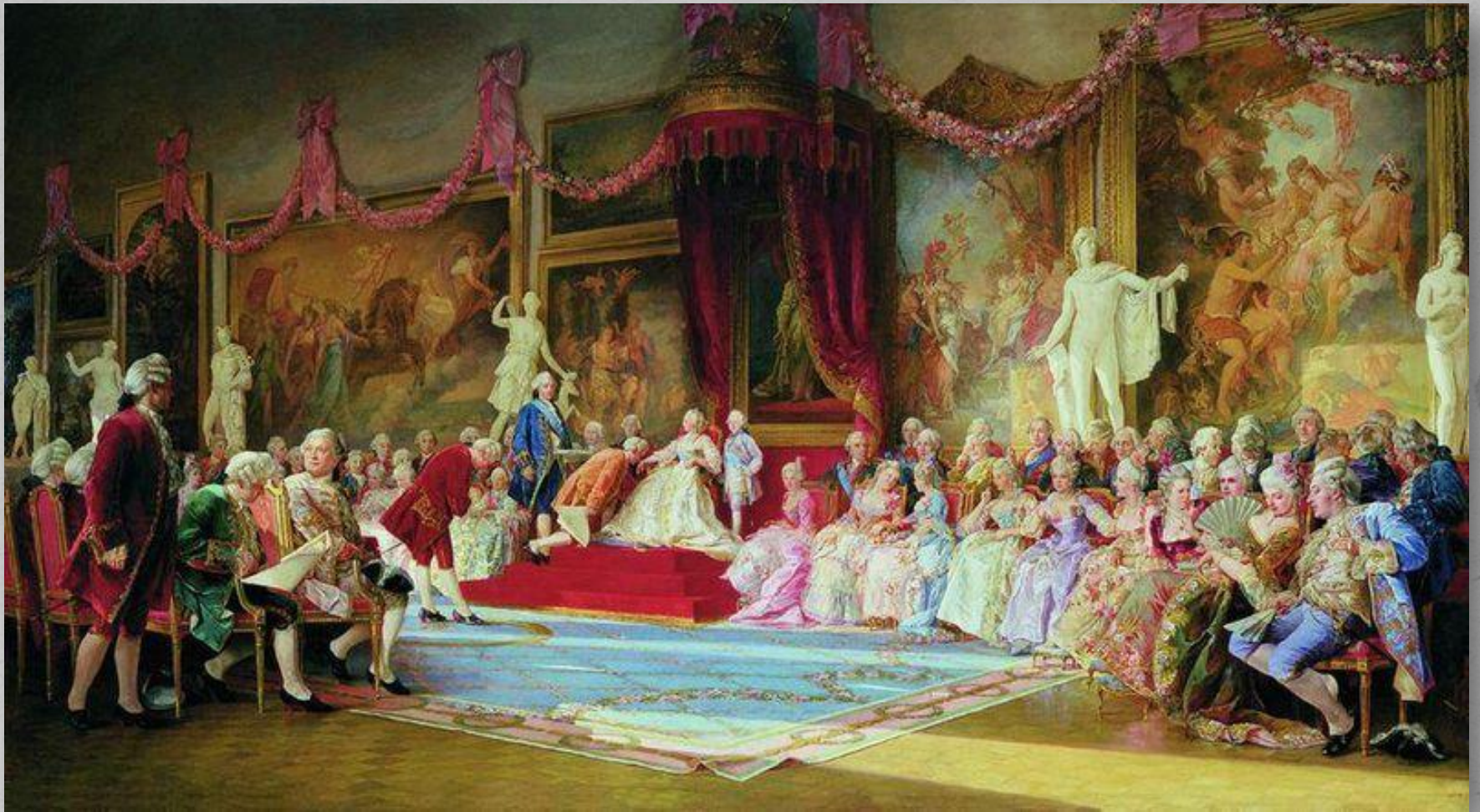
The Inauguration of the Academy of Arts , a painting by Valery Jacobi.