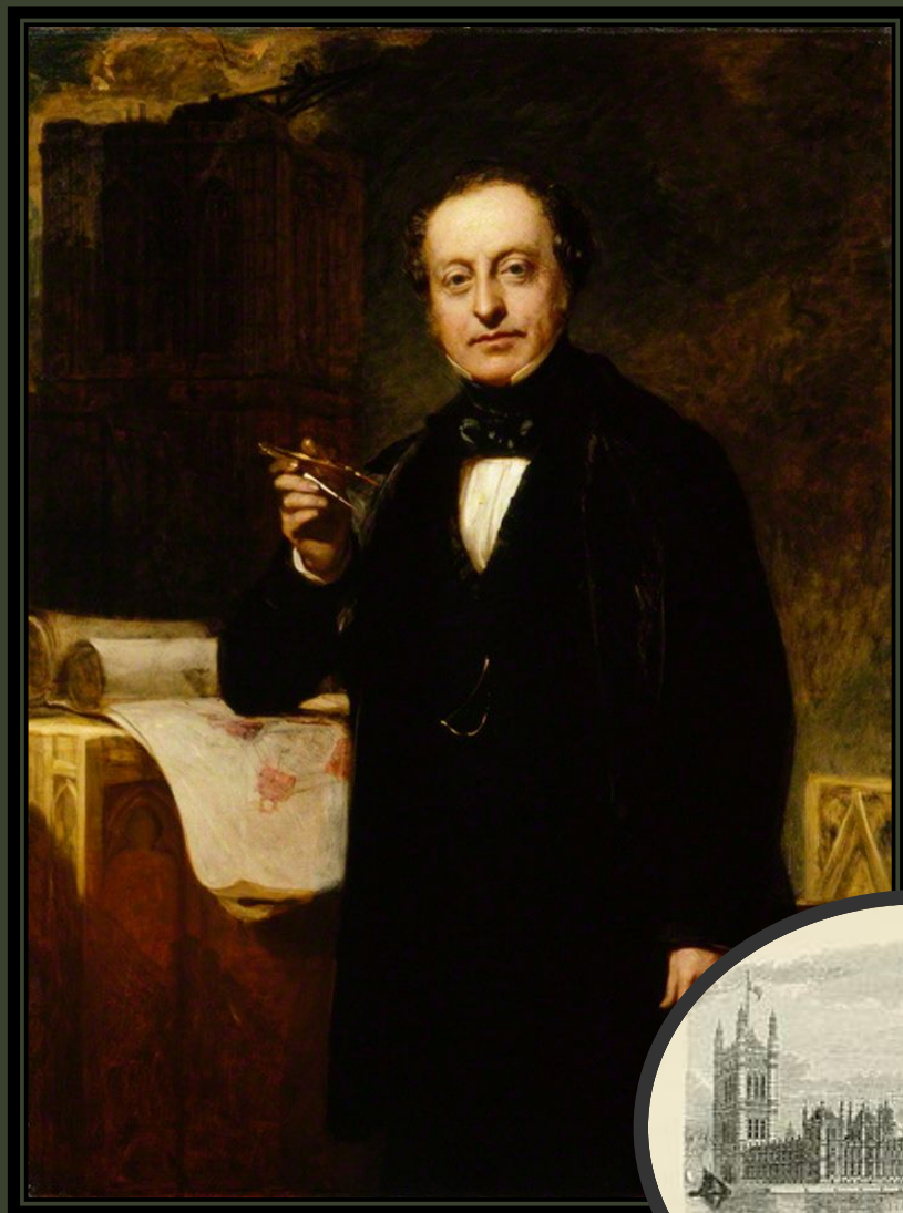
Портрет сэра Чарльза Барри р. Прескотта Найта

After a fire in 1834, a new palace building was erected in the neo-Gothic style by architects Barry and Pugin.