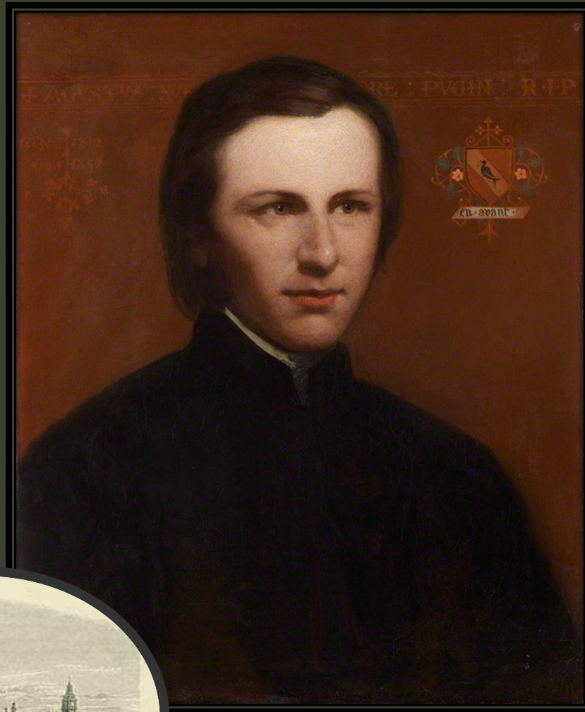
Augustus Welby Northmore Pugin (1812-1852 гг.)