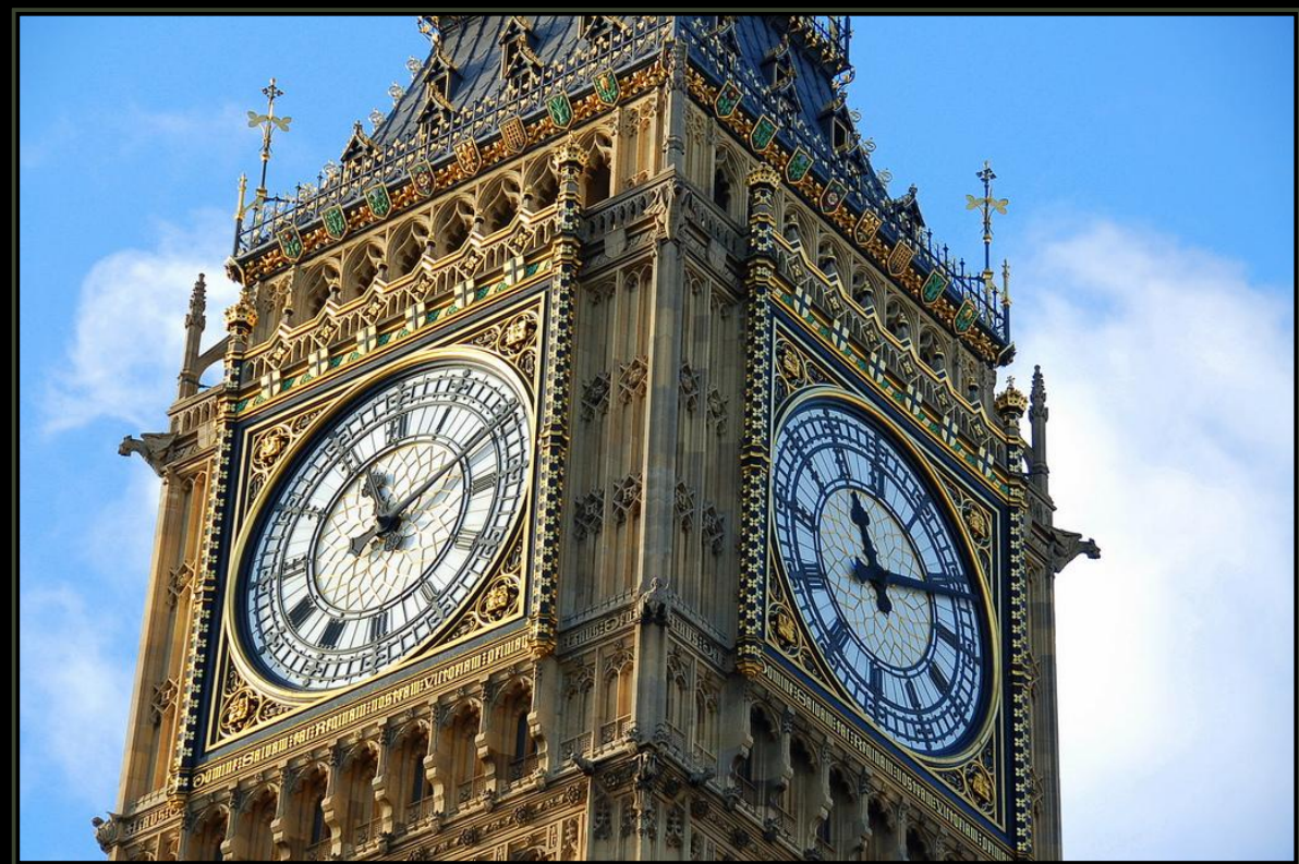
Tower of Elizabeth (Big Ben)

Of the palace towers, the most famous is the clock tower of Elizabeth (Big Ben) - the symbol of Great Britain.