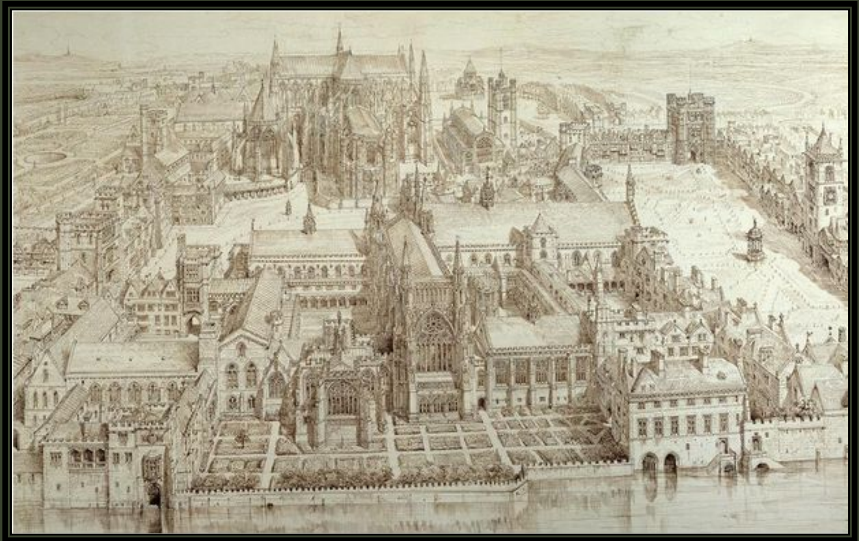
Medieval Palace of Westminster

The Palace of Westminster was the main royal residence during the late Middle Ages.