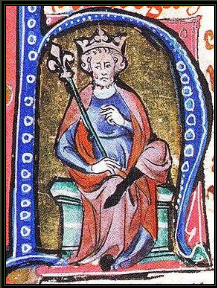
Knud the Great

The building of the English Parliament is the oldest and richest in history in England.