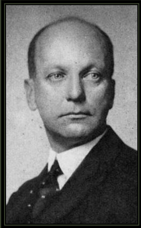
Giles Gilbert Scott

After the war, the reconstruction of the Chamber began under the direction of architect Sir Giles Gilbert Scott. It was completed in 1950.