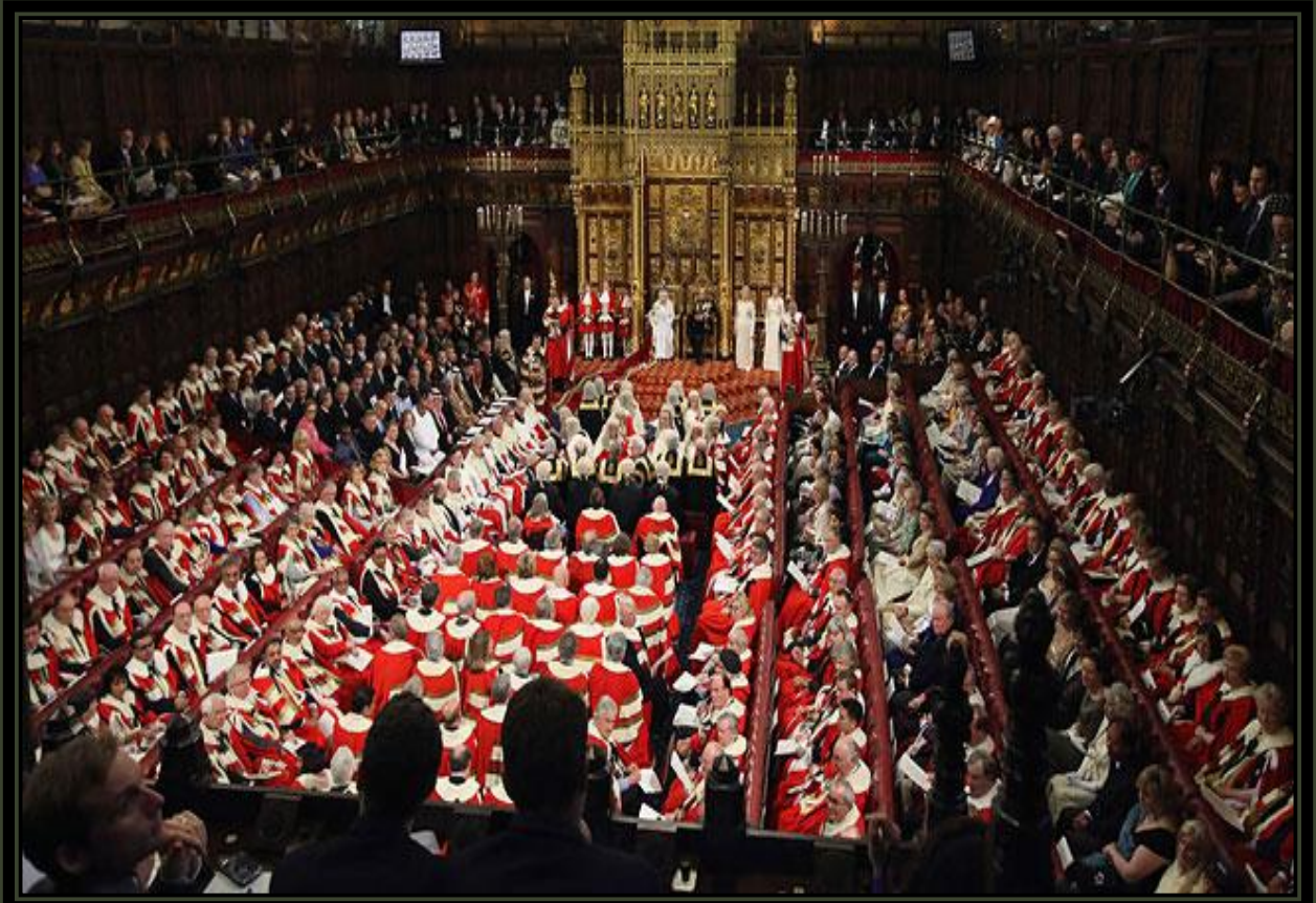
Boardroom of the House of Commons and the House of Lords