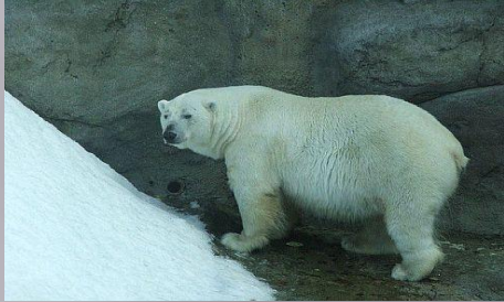
A White Polar Bear