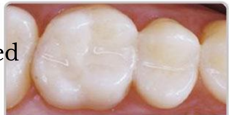
White composite filling