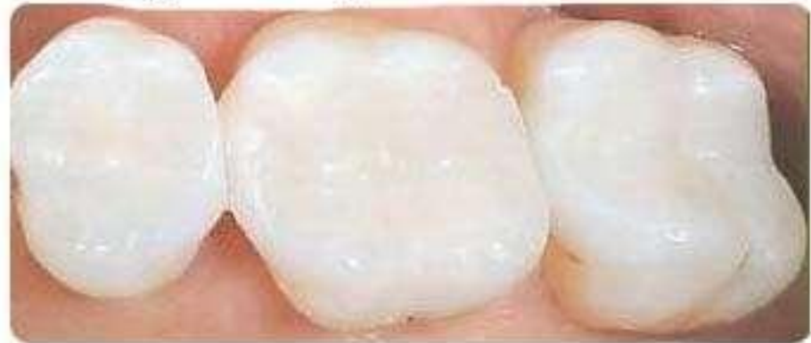
Composite White Fillings