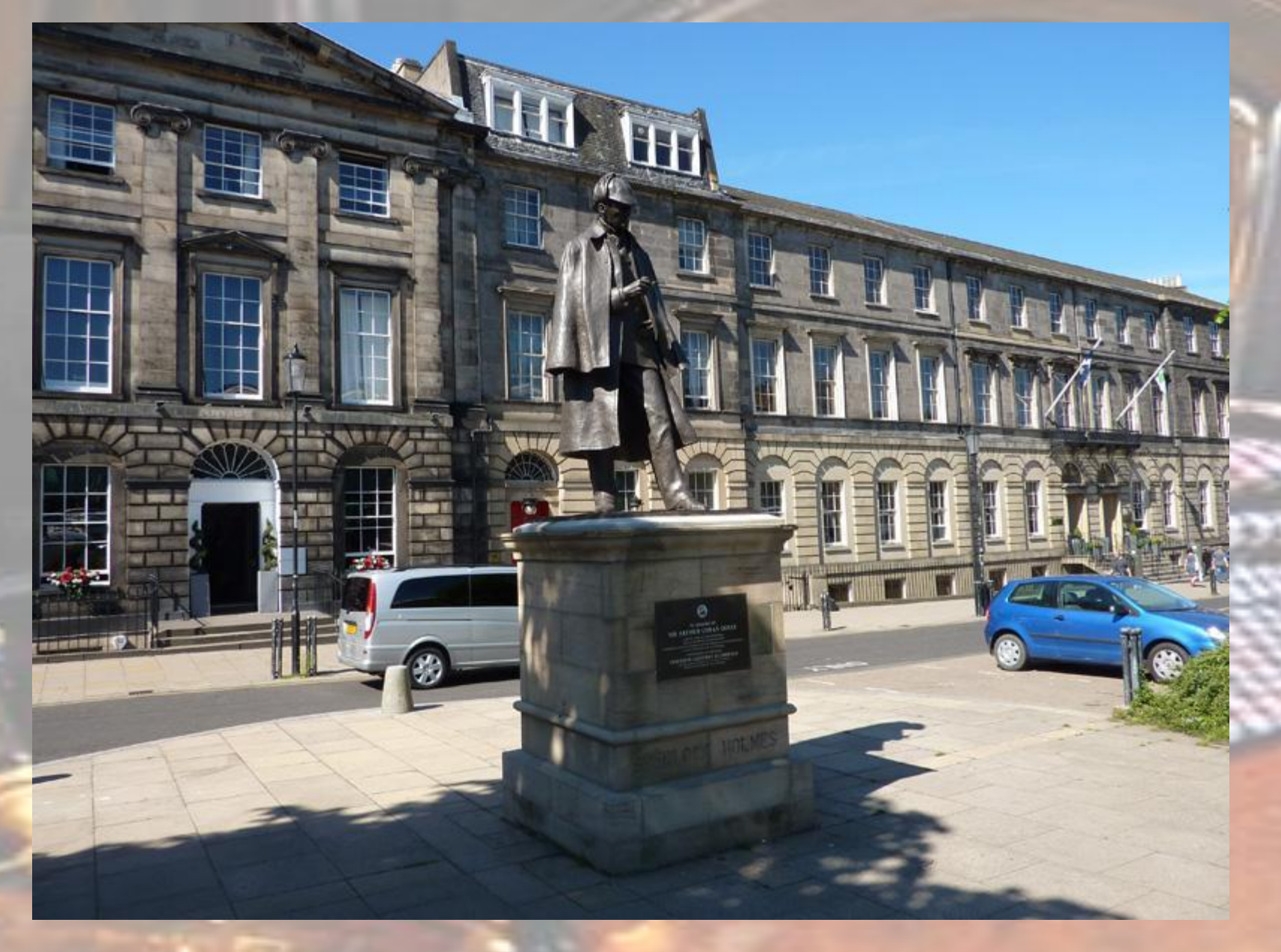
KILLED OFF HOLMES IN 1893 BUT PUBLIC OUTCRY BROUGHT HIM BACK TO LIFE!