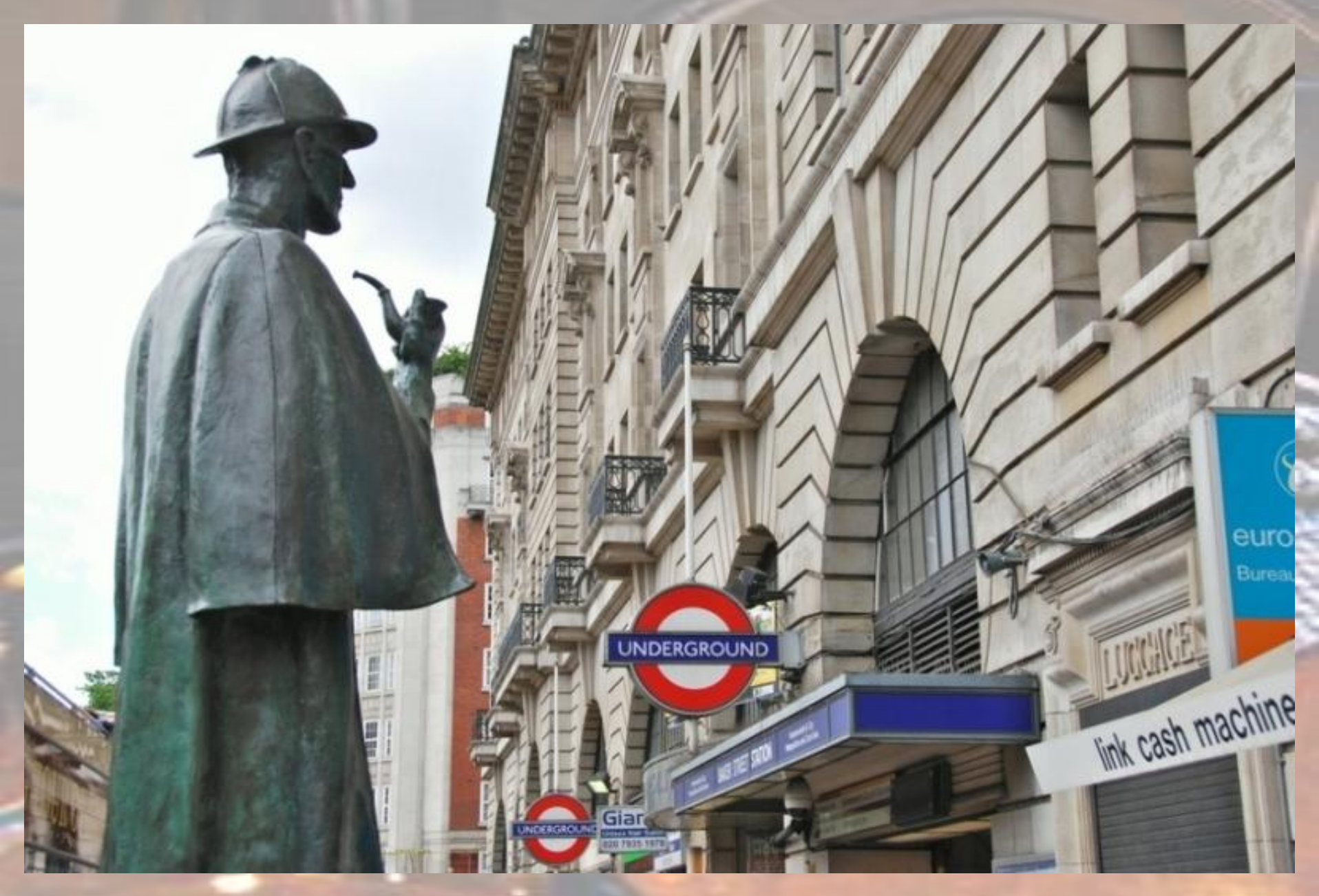
HOLMES APPEARED IN 56 SHORT STORIES AND 4 NOVELS