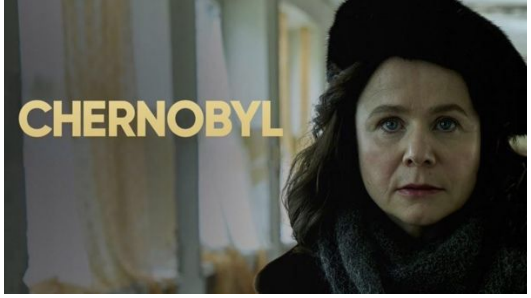
"Chernobyl" is a television mini-series in the genre of historical drama, created by the American television channel HBO together with the British television network Sky.