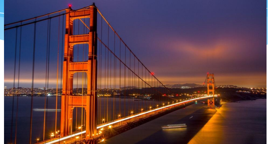
THE GOLDEN GATE BRIDGE