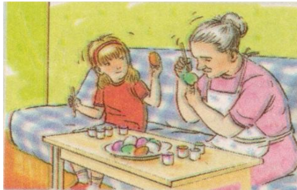
paint Easter eggs