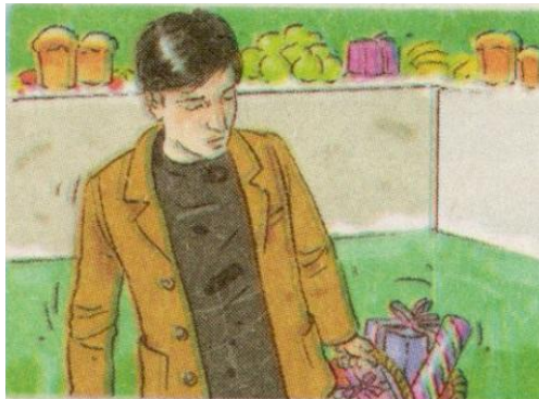
buys Easter presents and food