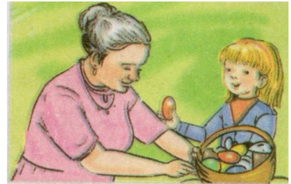
make an Easter basket