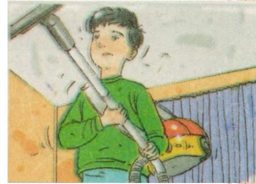
cleans the flat