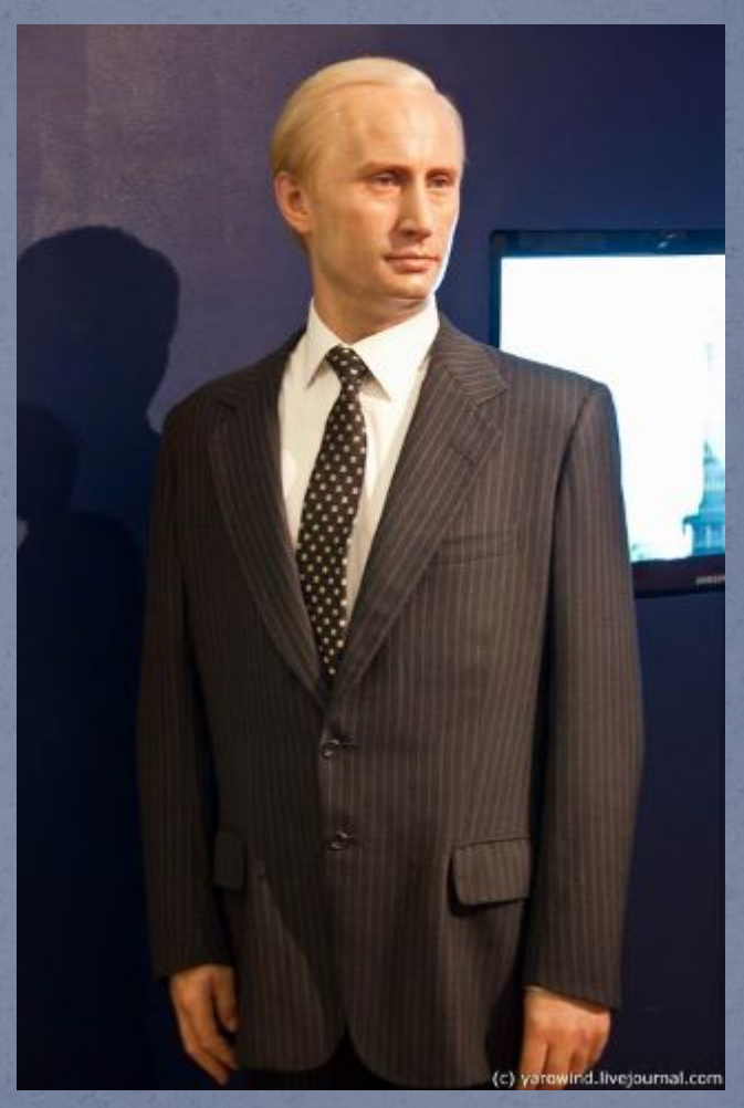
...figures of politicians...