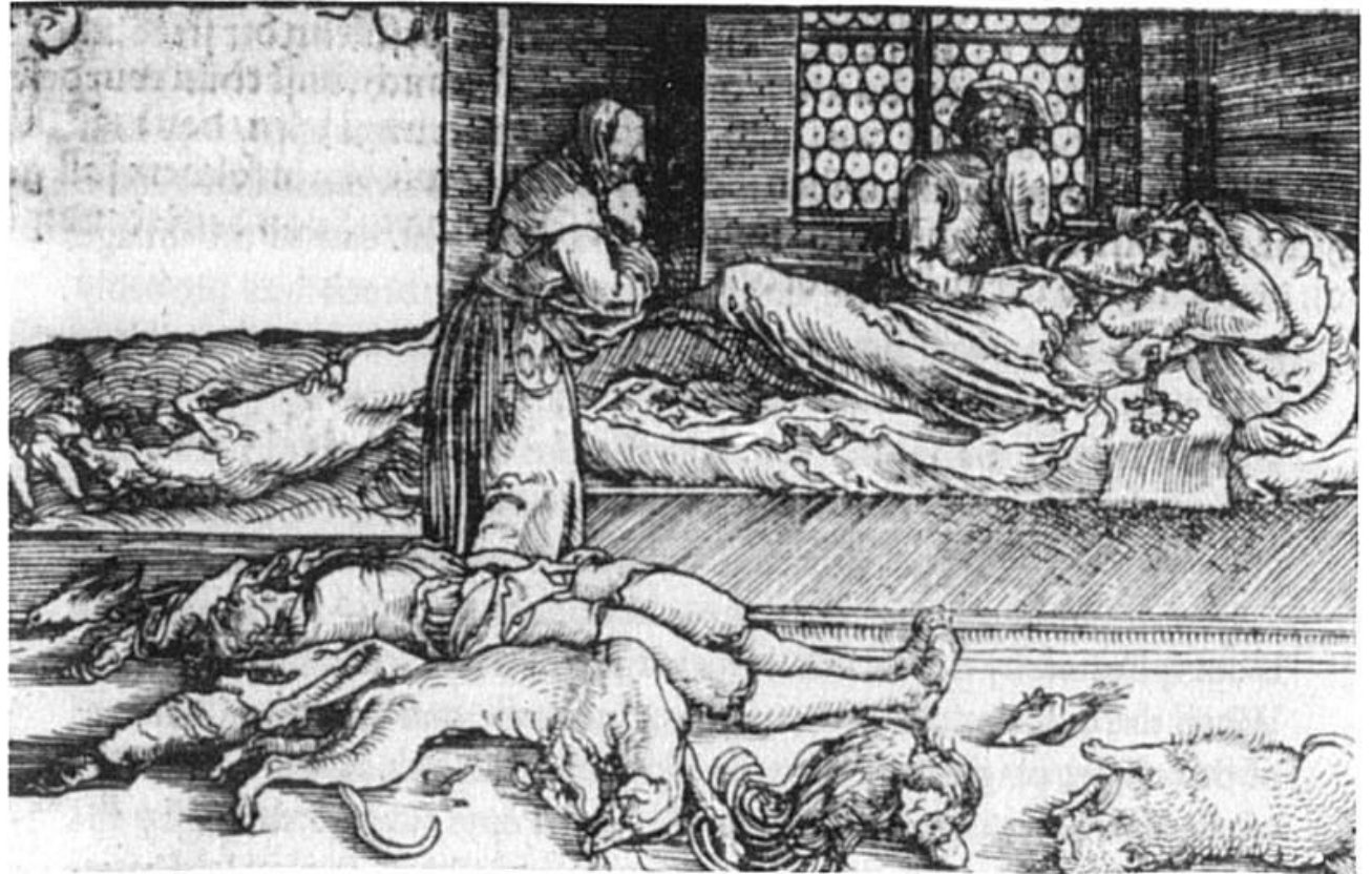
FIG. 4-2 Animal victims of the plague