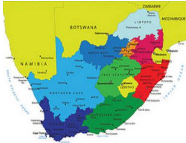
REPUBLIC OF SOUTH AFRICA