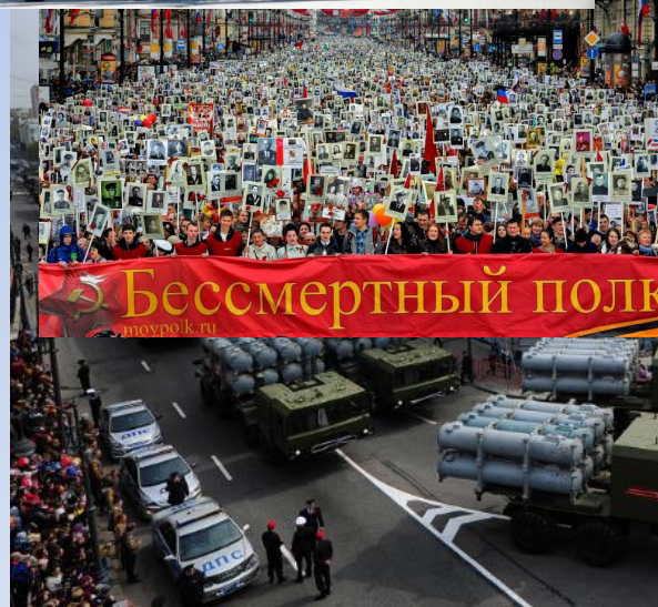
May 9 2017 parade