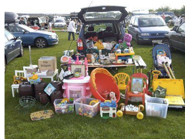
Car boot sale