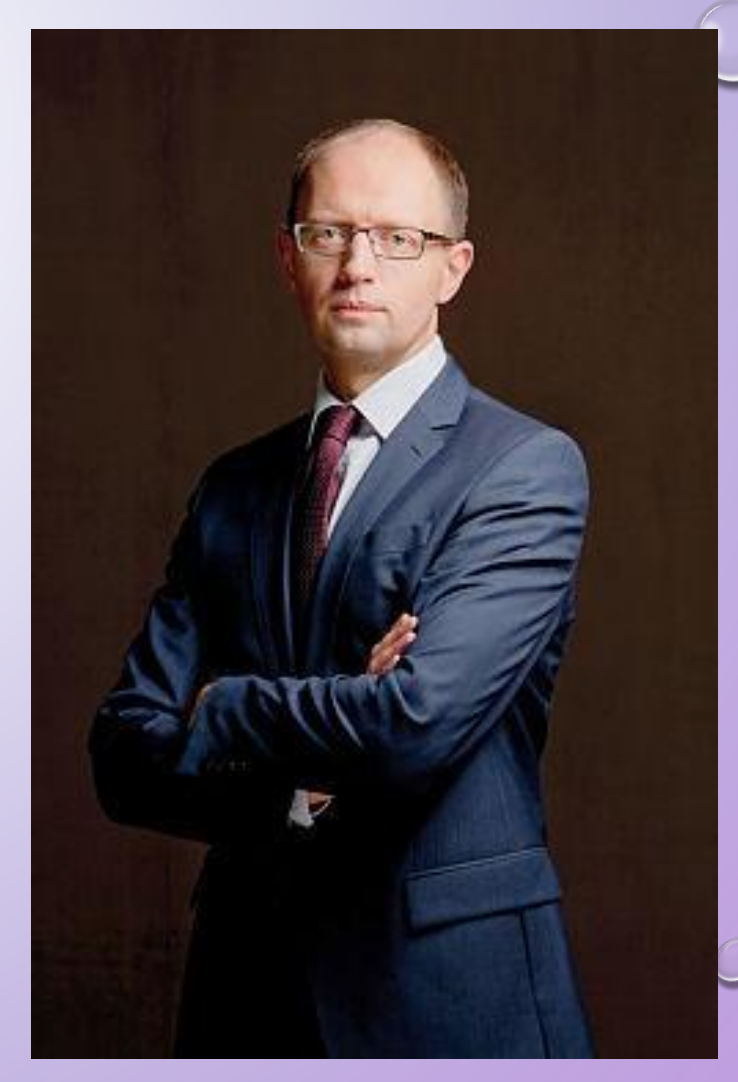
Arseniy Yatsenyuk - Ukrainian politician