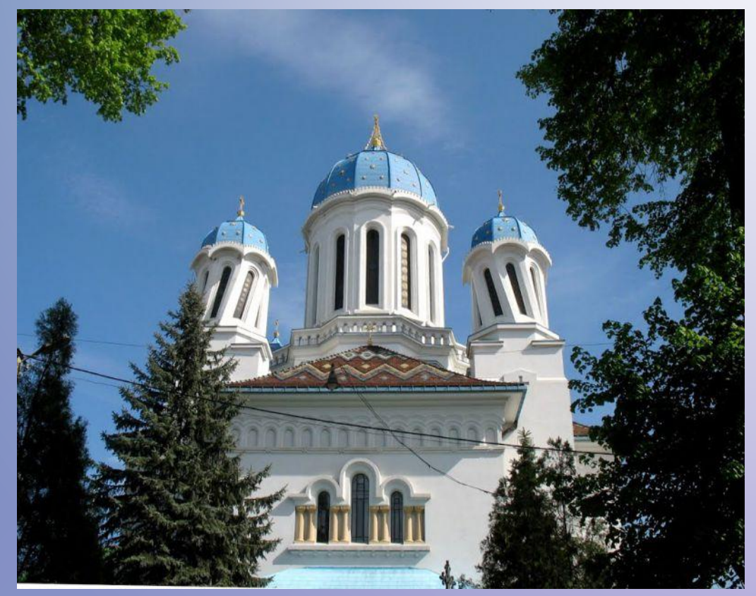
St. Nicholas Cathedral ("The Drunk Church").

The town design with its considerable relief differences creates variety of landscapes. The skyline is complicated by various confessions churches and the clock tower of the town hall.