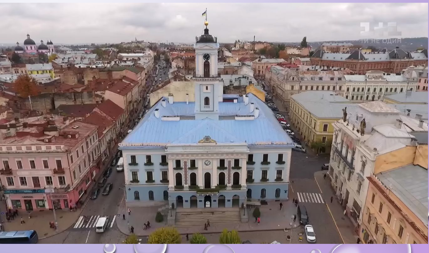
City clock hall