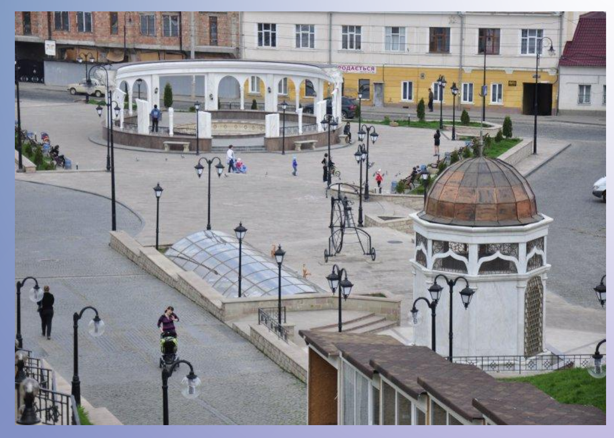
Square of Saint Mary

Square of a Turkish well, bath and the Church appeared in the city in the XVIII century.