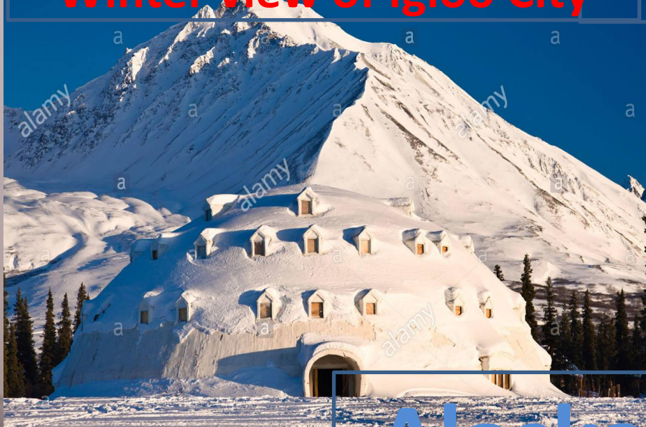
Winter view of Igloo City