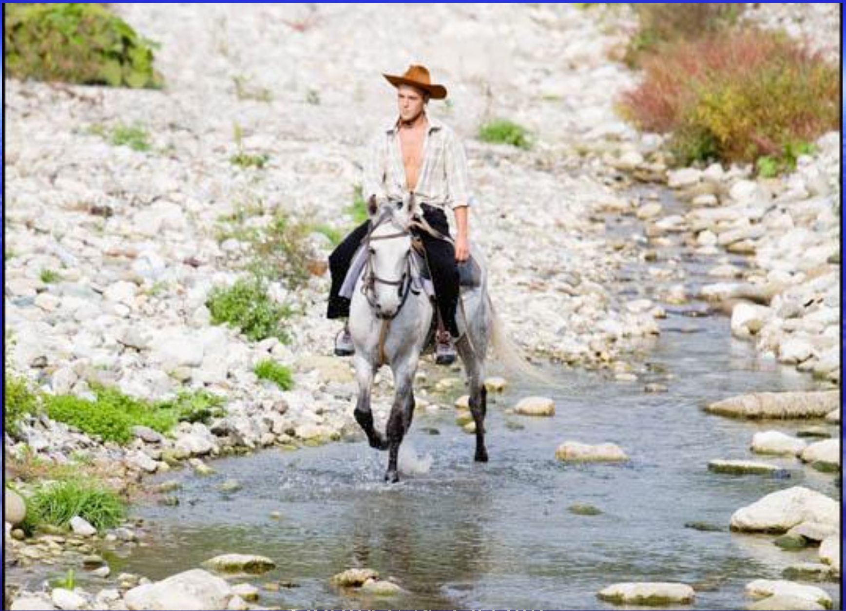
Goma E.N. Ercan No2