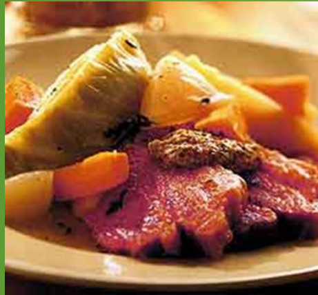
BACON AND CARBAGE