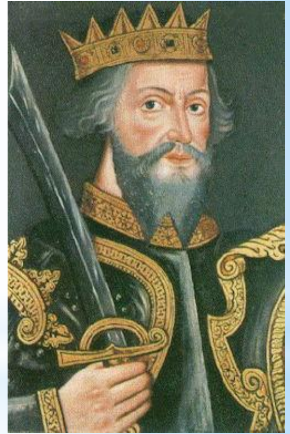
William the Conqueror. 1027 (28)- 1087