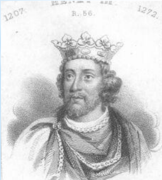
King Henry III

Henry III built a luxurious royal palace within the castle during the middle of the century, and Edward III went further, rebuilding the palace to make an even grander set of buildings in what would become "the most expensive secular building project of the entire Middle Ages in England". Edward's core design lasted through the Tudor period, during which Henry VIII and Elizabeth I made increasing use of the castle as a royal court and centre for diplomatic entertainment.