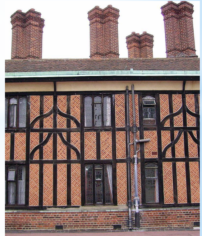
The Horseshoe Cloister, built in 1480 and reconstructed in the 19th century