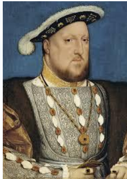
King Henry VIII