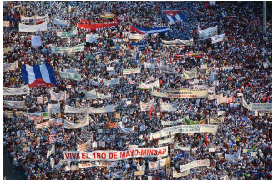
Cuba's independence day