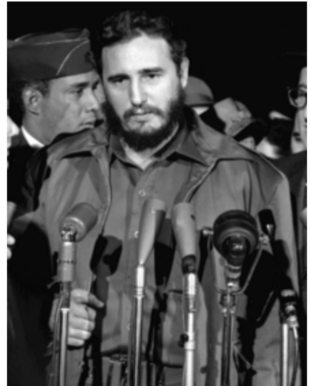
Castro during a visit to the United States in 1959