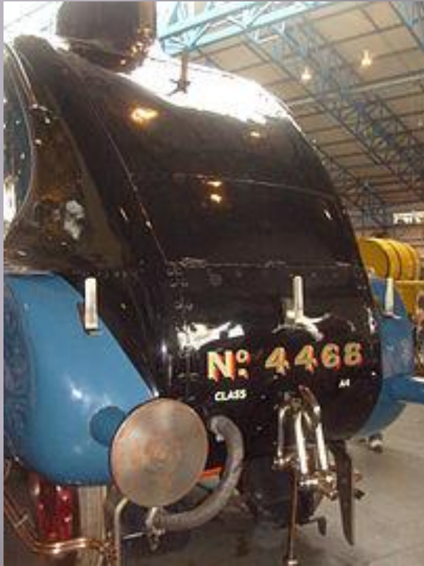
4468 Mallard at the National Railway Museum York (2009)