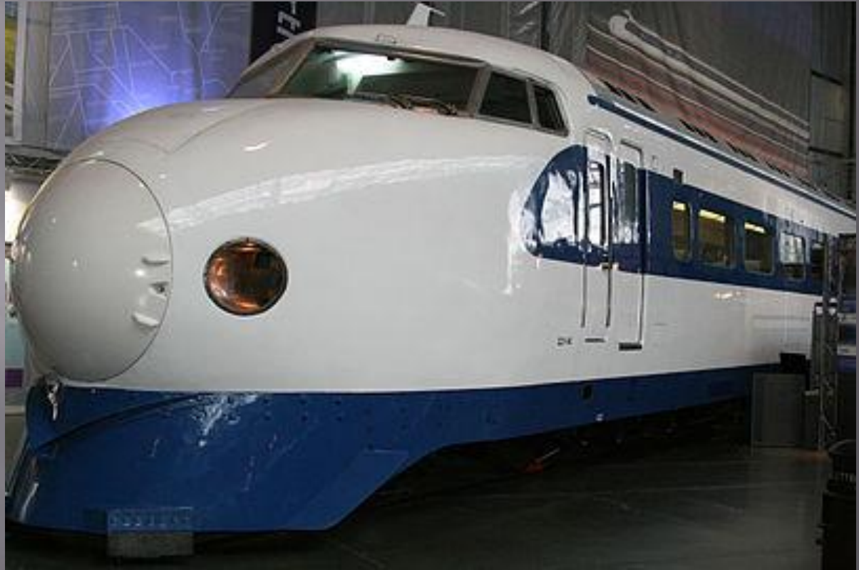
A Japanese 0 Series Shinkansen (No.22-141) at the NRM (2007)