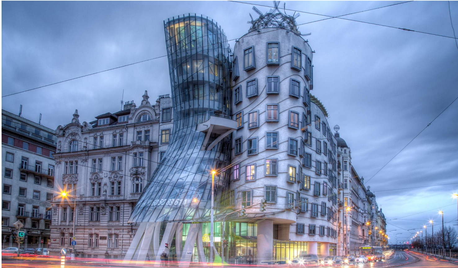
The dancing house

This house was made in unique architecture style, name of which is deconstructivism.