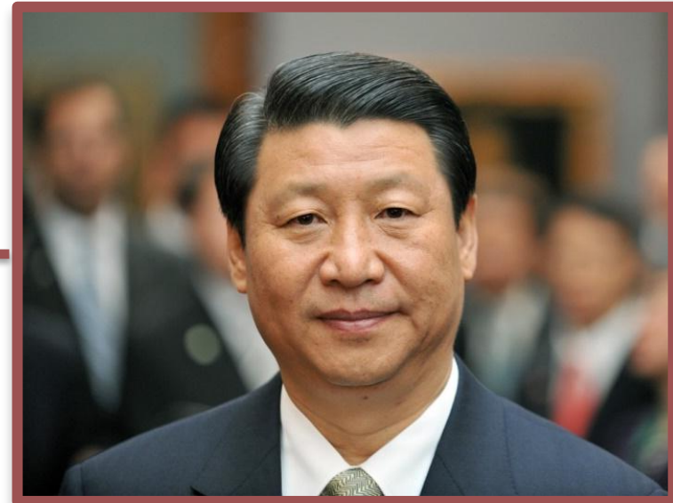
Xi Jinping since 14 March 2013 Term of office 5 years (no more than 2 terms)