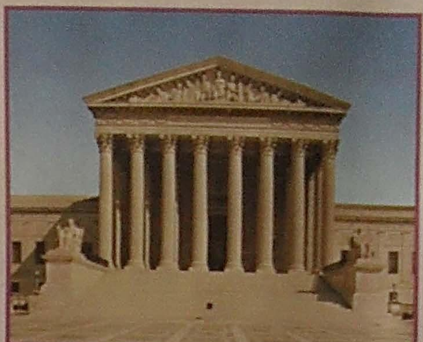
The Supreme Court