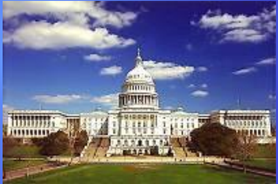
U. S. Capitol Building