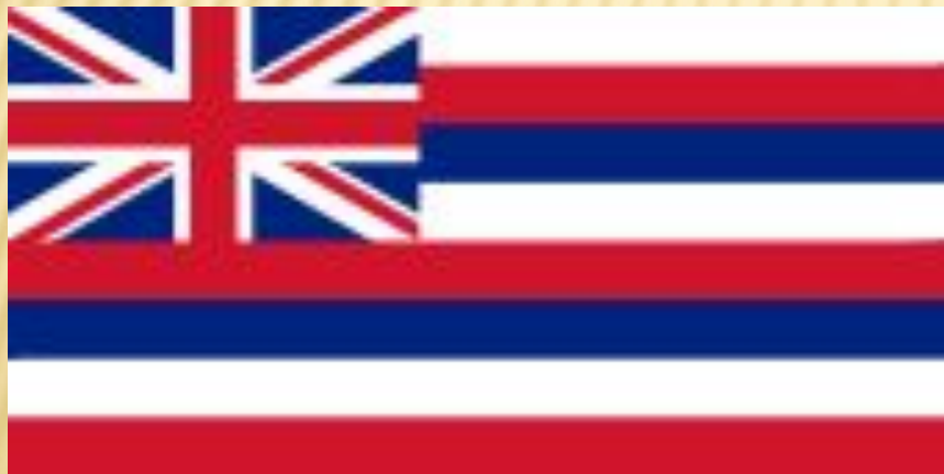
Flag of Hawaii