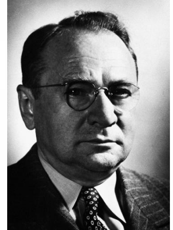
Zworykin Vladimir Kozmich