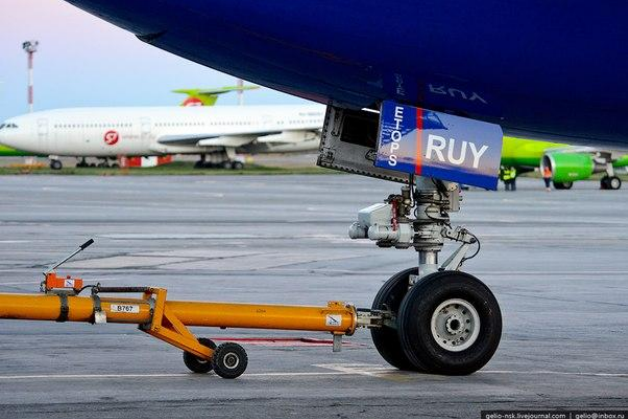
getty-rtk.livejournal.com | getty@inbox.ru