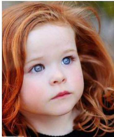
In the past

My hair was red when I was a girl, but it's grey now.