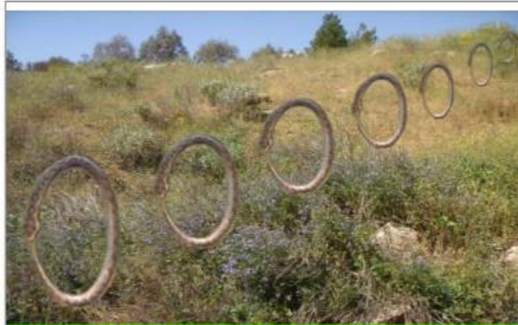
Spring Migration of the California Hoop Snakes