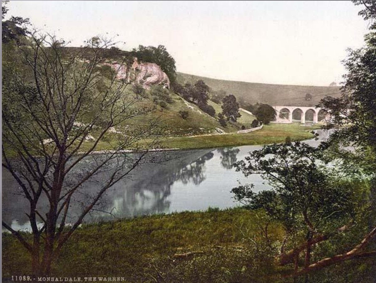
11089. - MONSAL DALE. THE WARREN.