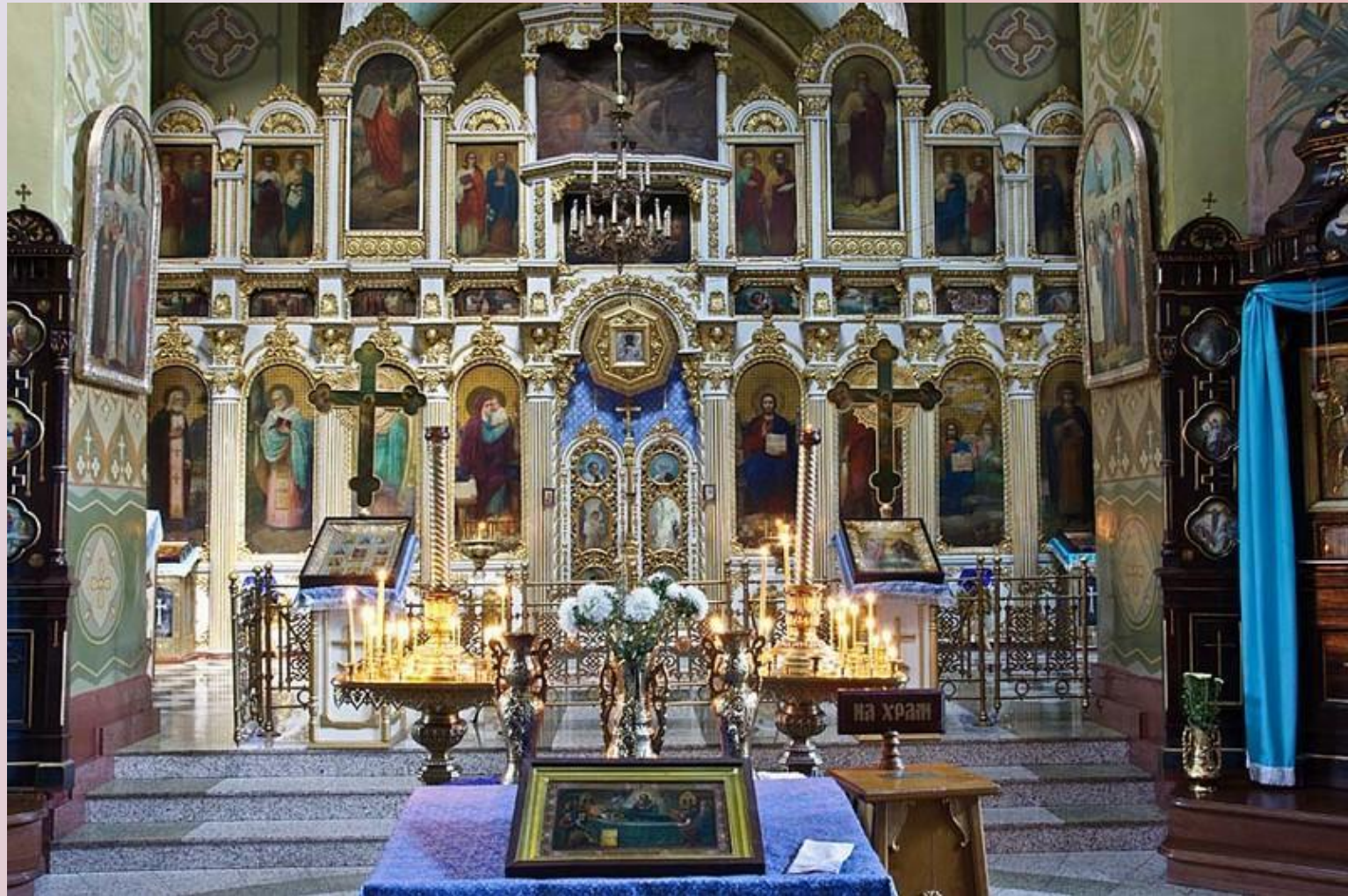
Holy Trinity Cathedral (1837-1860). This is the main church of Dnipro.