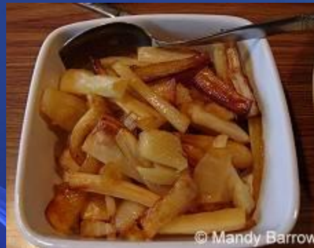
Parsnips and Swede