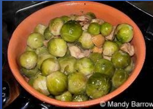
Brussel Sprouts and chestnuts