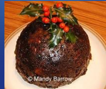
The Christmas pudding