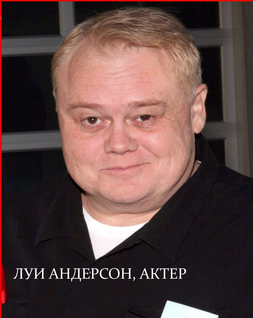
ЛУИ АНДЕРСОН, АКТЕР