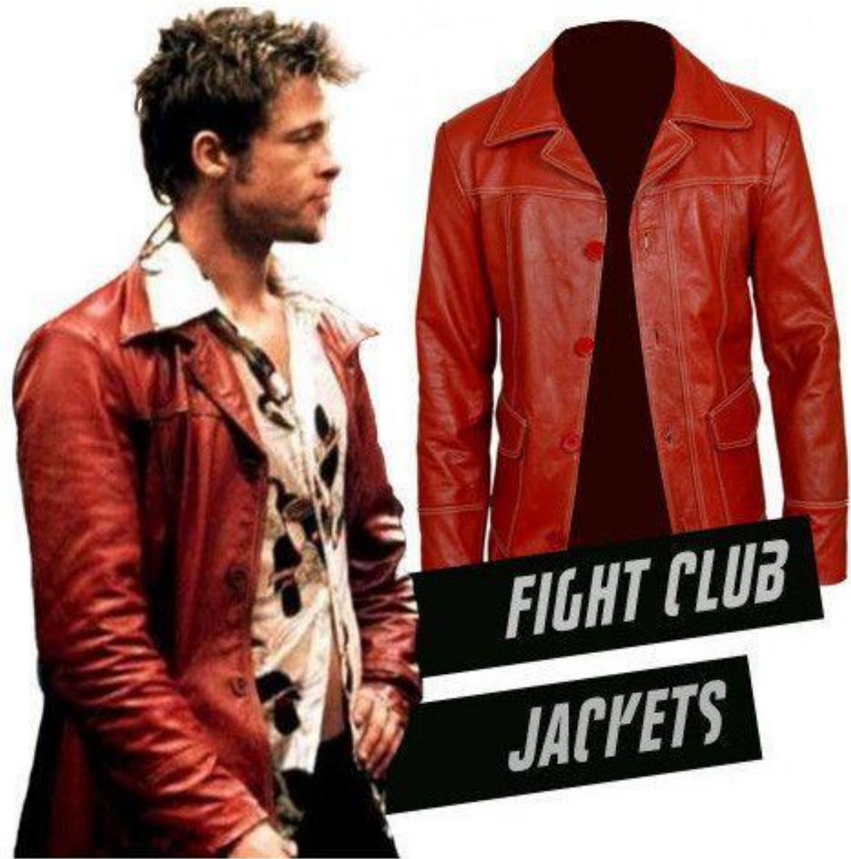
Brad Pitt's red leather jacket from the movie "Fight Club"