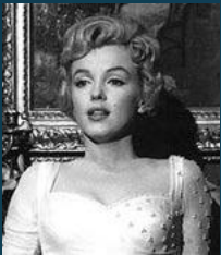
Marilyn Monroe (1926 – 1962) American actress / singer / model.