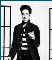
Elvis Presley (1935 – 1977) American pop singer.