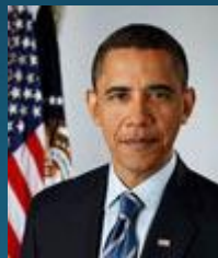
Barack Obama (1961- ) US President 2008-2016.