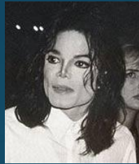
Michael Jackson (1958 – 2009) American pop singer.