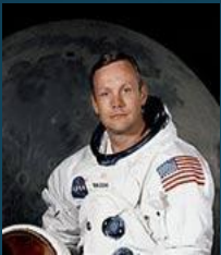
Neil Armstrong (1930 – 2012) US Pilot and astronaut.