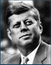
John F. Kennedy (1917 – 1963) US President.