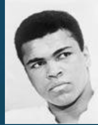
Muhammad Ali (1942 – ) American Boxer and civil rights campaigner.