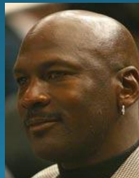
Michael Jordan (1963 – ) Legendary basketball player.