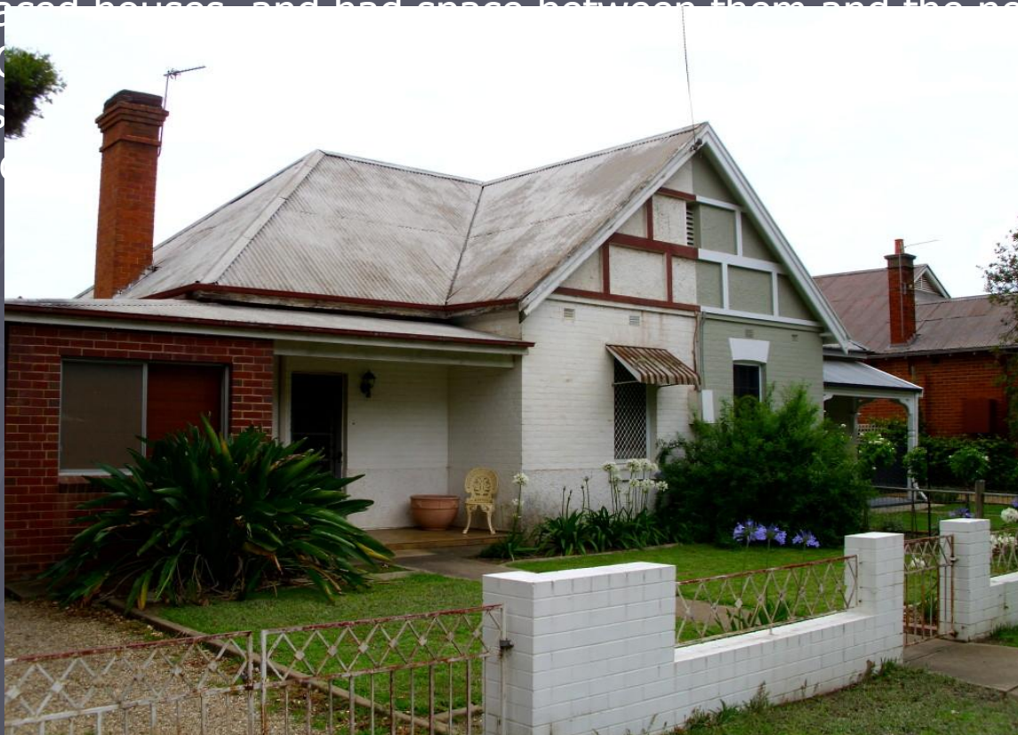
Semi- detached дом в Street Томпсон.

Detached house is a house that stands separate from its neighbouring property on all sides, thus being physically DETACHED. When modern housing estates started to be built in the 1920's they became very popular, as were marketed being far superior to terraced houses is a house that stands separate from its neighbouring property on all sides, thus being physically DETACHED. When modern housing estates started to be built in the 1920's they became very popular, as were marketed being far superior to terraced houses, and had space between them and the neighbour on both sides. More expensive detached house