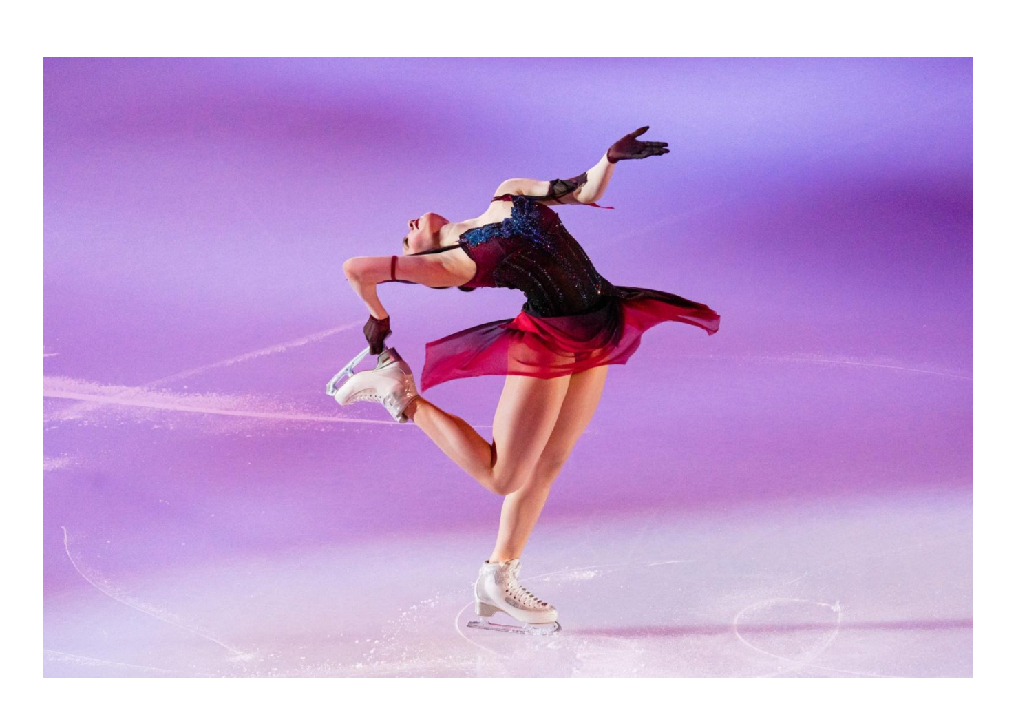
FIGURE SKATING IS A SPEED SKATING SPORT. THE MAIN IDEA IS TO MOVE AN ATHLETE OR A PAIR OF ATHLETES SKATING ON ICE AND PERFORM ADDITIONAL ELEMENTS TO MUSIC.