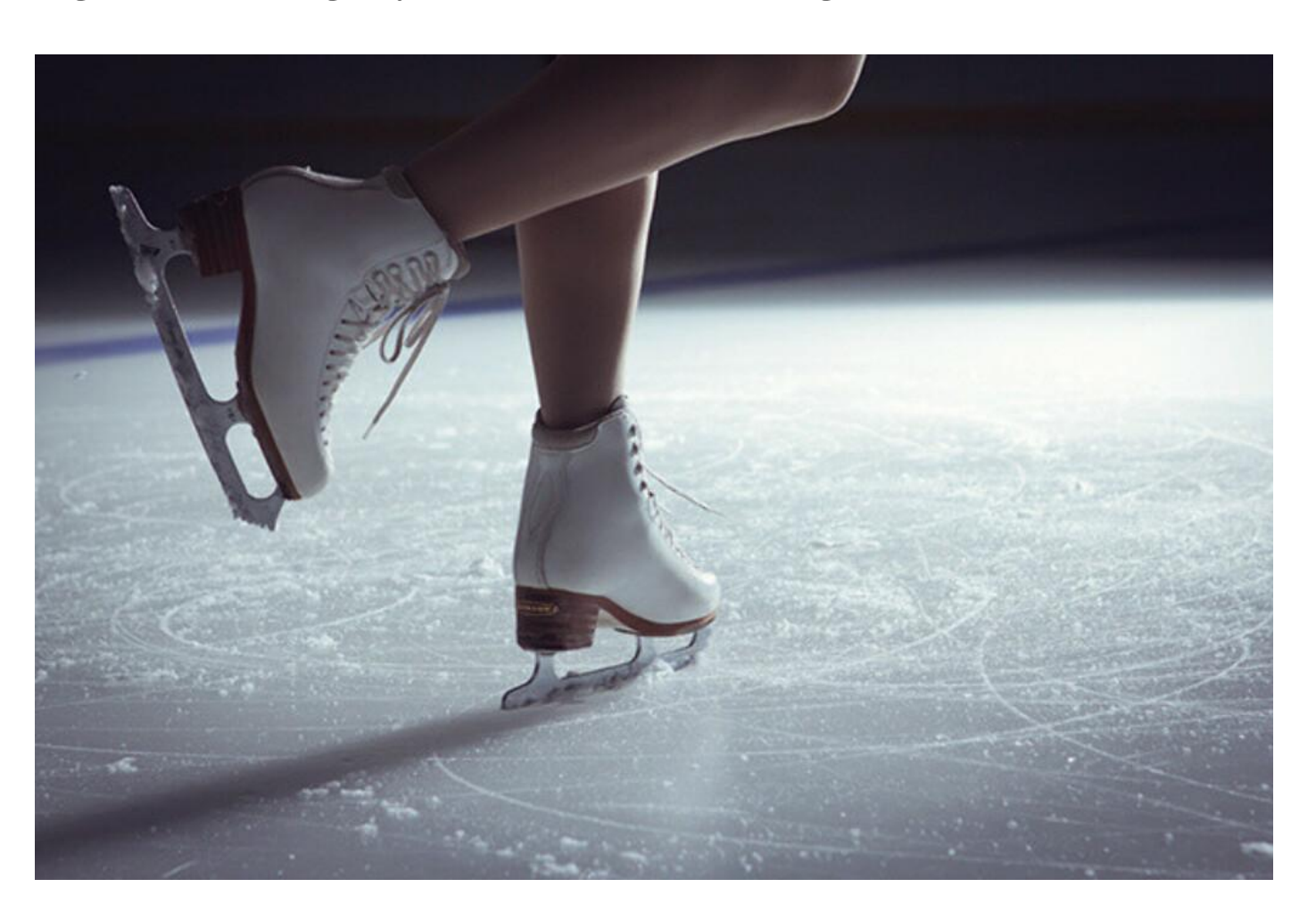
Figure skating has types: individual women's and men's, pair figure skating, synchronized skating.