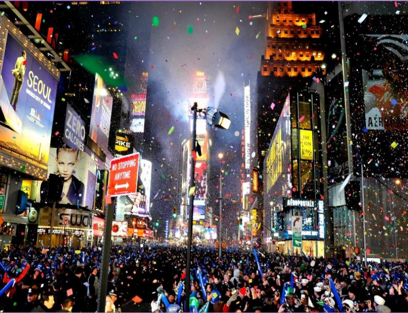
Times Square in New York.

Tradition to celebrate the New Year in USA appeared with XVII century. This custom came from Netherlands. The New Year in USA celebrates either at the midnight on the 1 st of January from the 31 st of December like in Russia, Israel, France and whole Europe and West. Times Square in New York is the most popular place for celebrating of the New Year. Champagne is either popular drink to the New Year like in Russia, France and whole Europe and West.