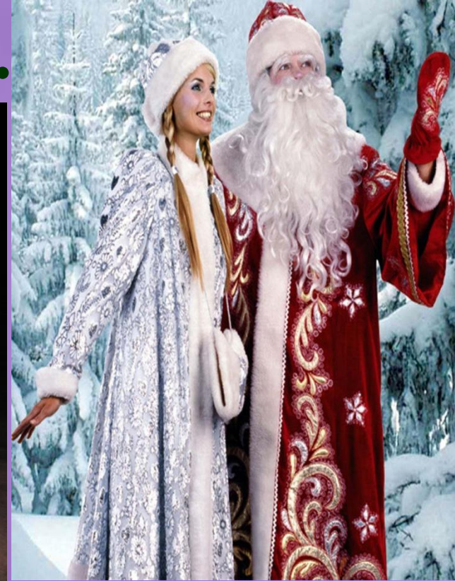
Grandfather Frost and Snow-Maiden.