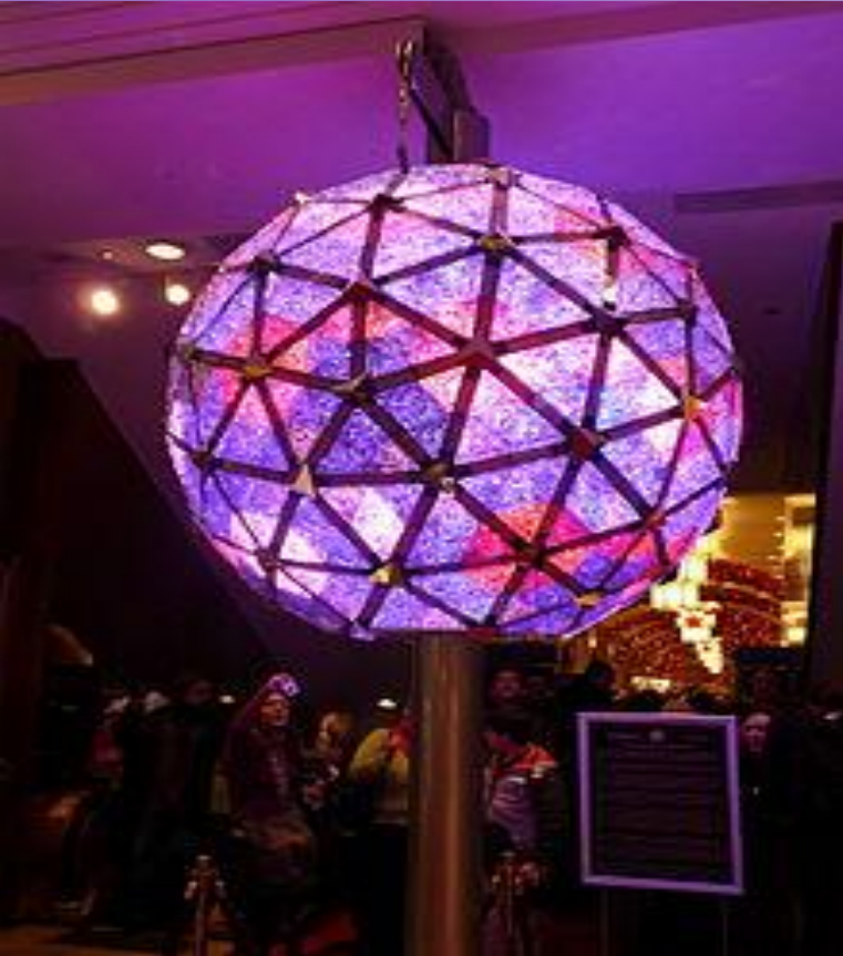
Times Square Ball.

USA either celebrates the New Year in the bosom of family or friends like in France. Americanmen celebrate the New Year at clubs, casinos, squares of towns and cities, pubs, bars, cafes and restaurants, etc. Celebrating of the New Year is the most ceremonial in New York. Some casinos gives free toasts to champagne in their crush-rooms. The lowering of shining sphere is main symbol coming of the New Year in USA.