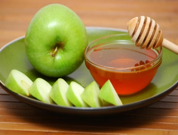
Apples with the honey.