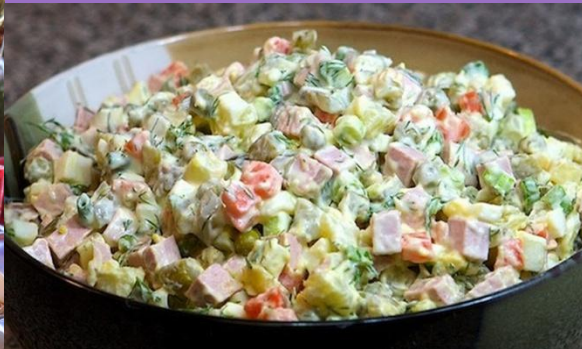
Russian Salad and Champagne.