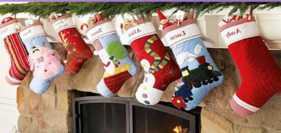
Socks with presents in the fire-place.

Symbols and attributes in France are either like in Russia. On the New Year's table are salads, meat, sweets, fruits, wine, champagne and baking. Santa Claus is the Grandfather Frost in France. The children hang socks for presents to a fire-place.