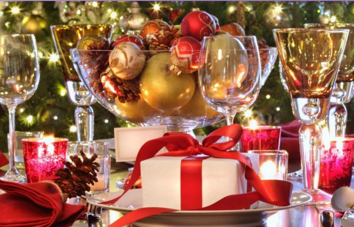
New Year's table and presents.