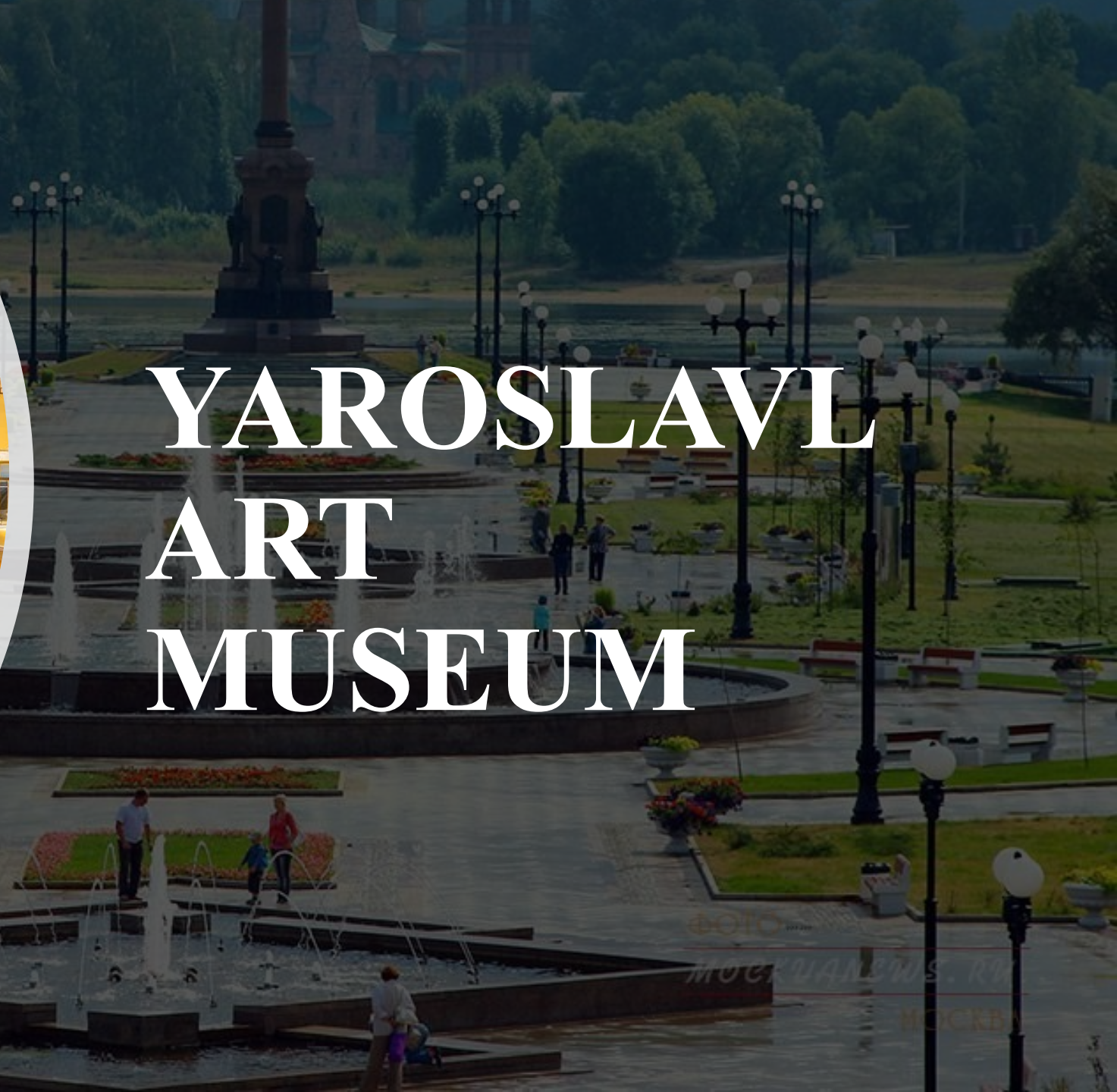
ФОТО МУС МОСКВА