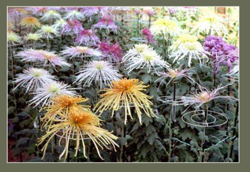
Image of it sacredly, and the members of emperor's house use only. Other, in the case of breach of this law, are punished a death penalty. Punished a death penalty and every attempt to represent this emblem of the Japanese empire and character of emperor's power, and that is why to the image its Japanese government comes running sometimes even and for preventing of imitation of governmental money signs.

Explains reason of such high honouring of this flower Japaneses the best of all self his name: «kiku» (a sun). They have him character of this luminary, giving life to all on earth.