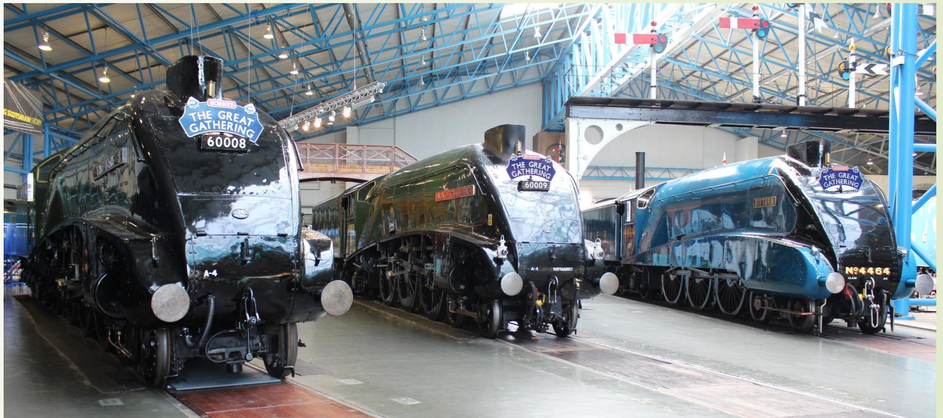
National railway Museum