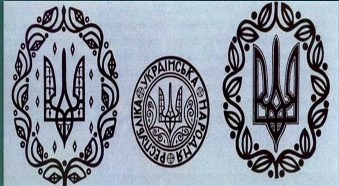
The emblem and seal of UNR