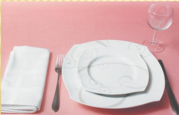
A plate for the second course