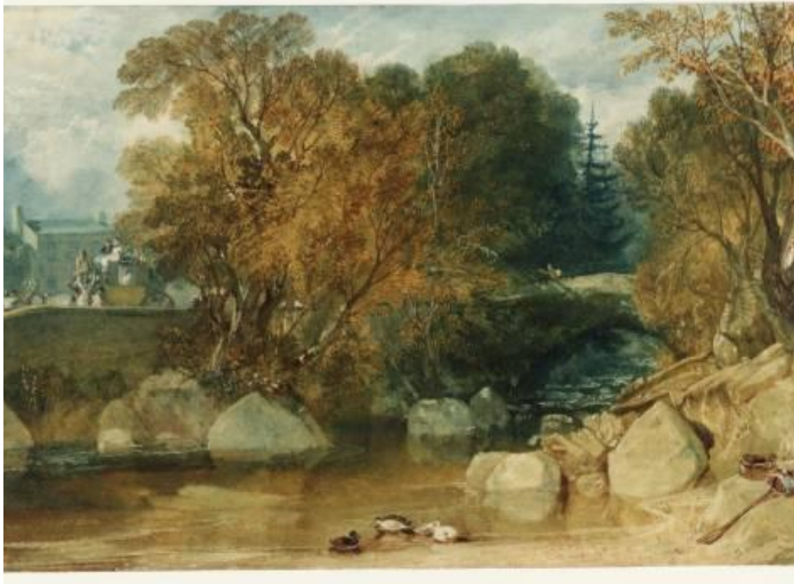
Ivy Bridge, Devonshire