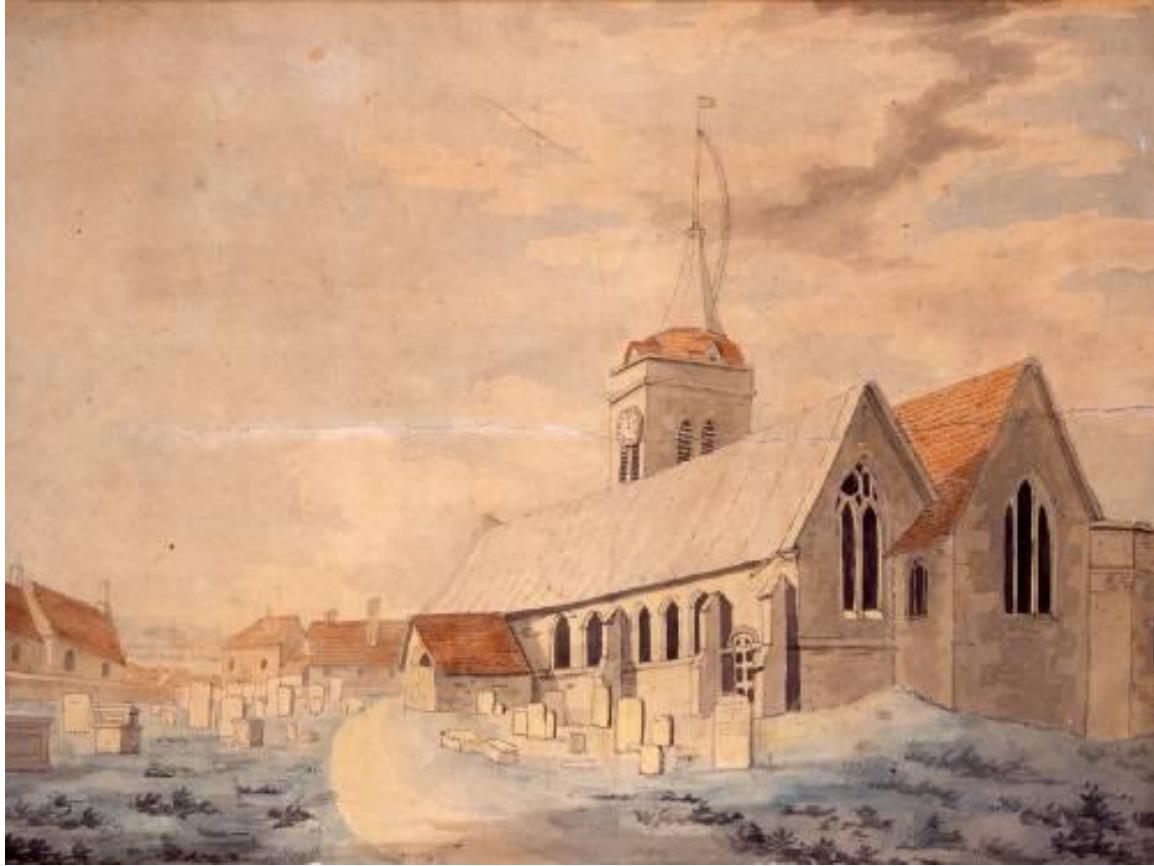
St John's Church Margate (1784)