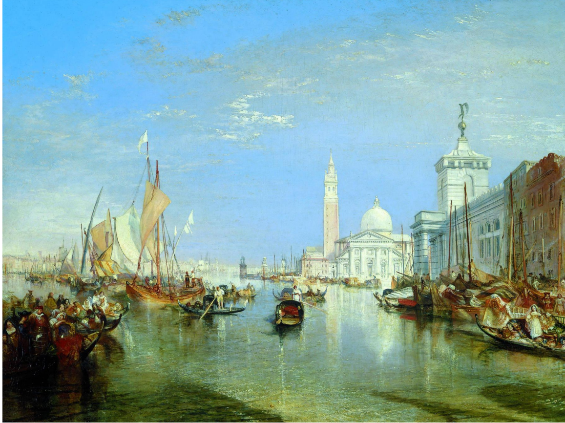
Venice: The Dogana and San Giorgio Maggiore (1834)