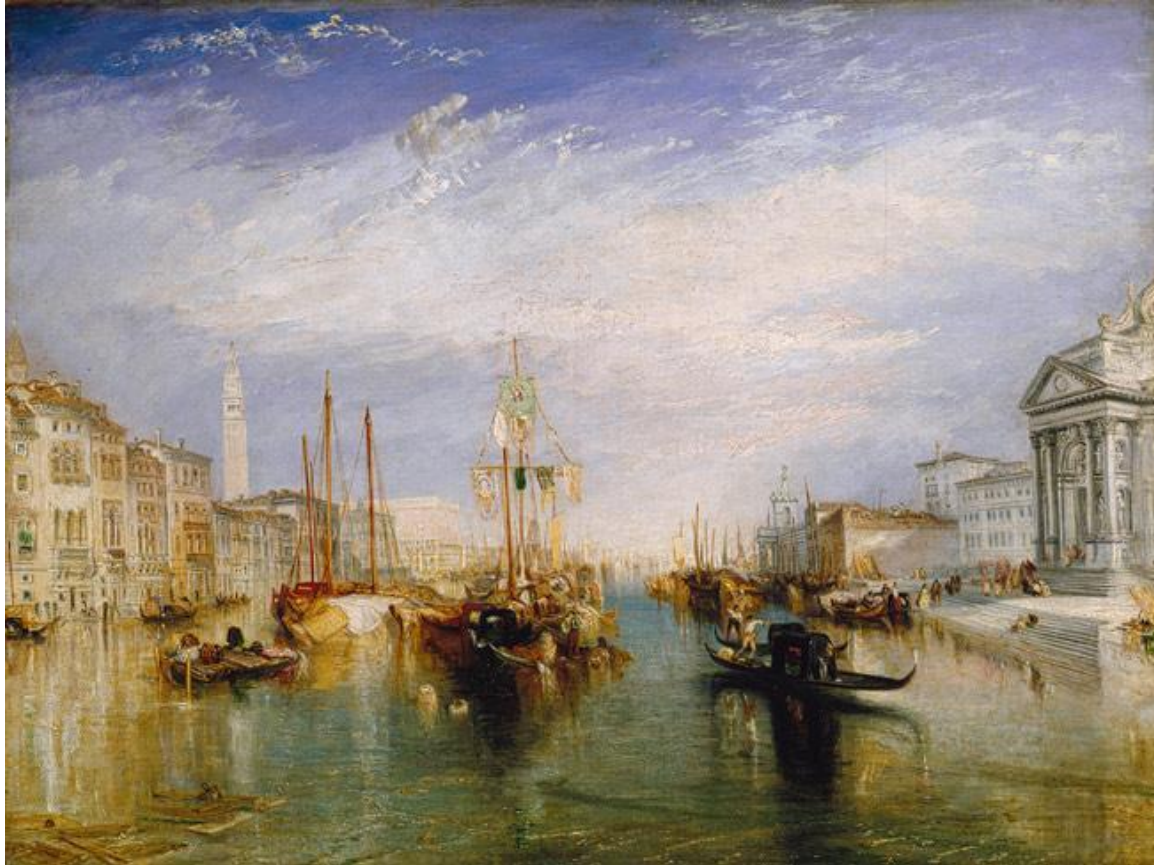
Venice, from the Porch of Madonna della Salute (1835)