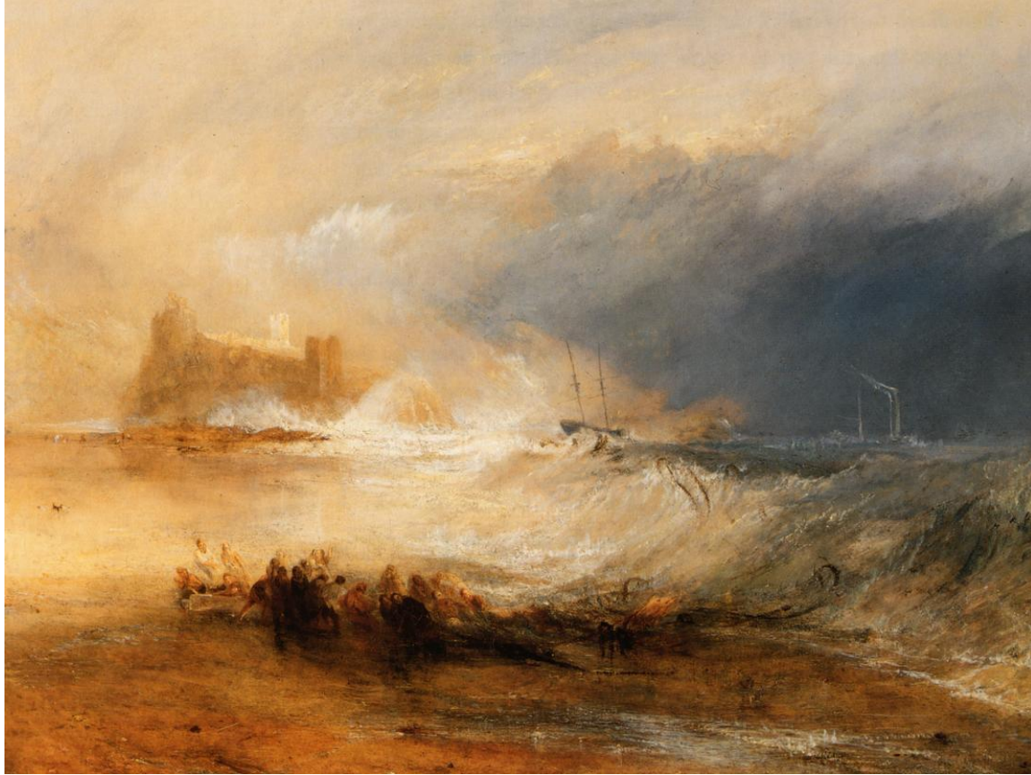
Wreckers -Coast of Northumberland, with a Steam-Boat Assisting a Ship off a Shore (1833-1834)