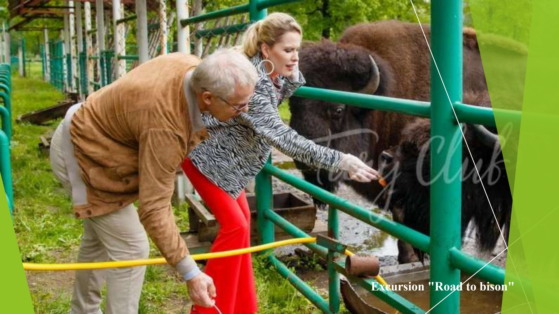
Excursion "Road to bison"